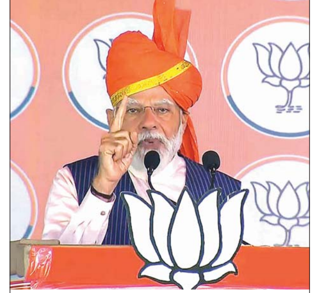
UDHAMPUR, PM Narendra Modi addresses a public rally ahead of the upcoming Lok Sabha election, in Udhampur on Friday.

He said that SP, Bahujan Samaj Party (BSP), and Congress kept on opposing the temple, but Modi built the temple and even a consecration ceremony was performed. "I want to tell you that an invitation for January 22 was sent to them, but they didn't attend the consecration ceremony because they are concerned about their vote bank. I want to tell you that those who did not let the temple be constructed for years do not have the moral strength to attend the consecration event," he said.