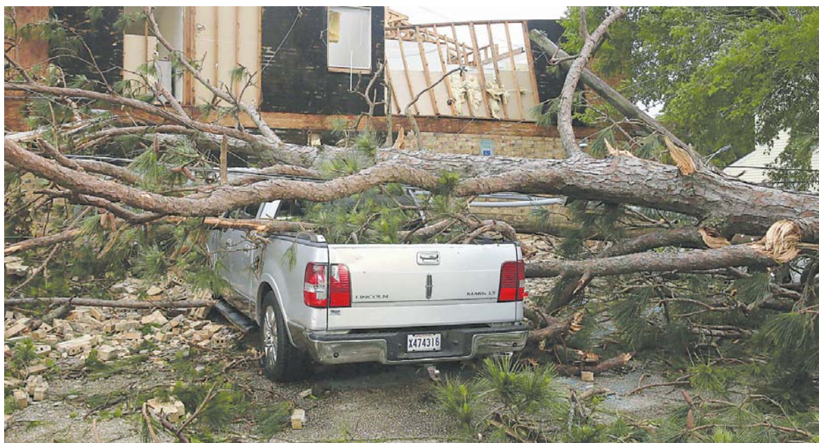
SLIDELL, A truck is seen covered by trees and debris in Slidell, Louisiana, the United States, April 11, 2024. One person was killed and more than 10 others were injured after severe storms battered the U.S. South stretching from Texas to Florida on Wednesday, authorities said.

celebrations in Dediapada, AAP leaders are intimidating officials and contractors to extort money. Recently, a taluka officer was reportedly coerced into paying Rs 2.5 lakh in the name of the MLA. "This type of extortion affects various departments within the taluka, where political leaders frequently pressure officials and contractors for financial contributions, potentially hindering development projects. "I urge taluka and district officials to avoid succumbing to such corrupt practices and to maintain the integrity of their work."