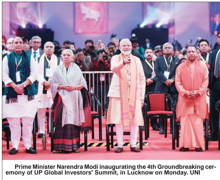
Prime Minister Narendra Modi inaugurating the 4th Groundbreaking ceremony of UP Global Investors' Summit, in Lucknow on Monday.

also the state BJP President, BJP National General Secretary Bandi Sanjay Kumar, All India President, BJP OBC Morcha, Dr K Laxman and party leaders Etela Rajender and DK Aruna will participate in all the yatras. The BJP, which won four out of 17 Lok Sabha seats in Telangana in 2019, has set the target of 10 seats in the forthcoming elections. The party leaders are confident of achieving the target in view of the impressive performance in the recent Assembly elections.