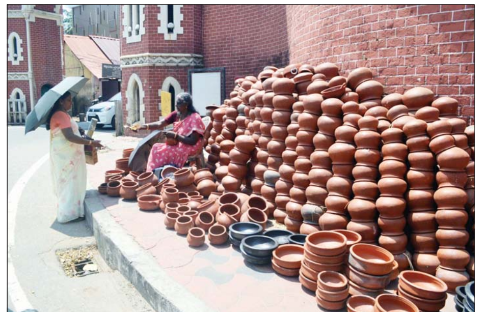
This capital city is gearing up for yet another Attukal Pongala, the largest annual gathering of women in the world, as women devotees are busy for purchasing pots for the ceremony, in Thiruvananthapuram on Monday.